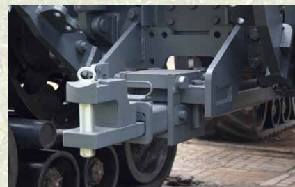
Drawbar rated for 11,000 lbs