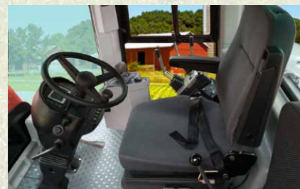
High Quality Seat