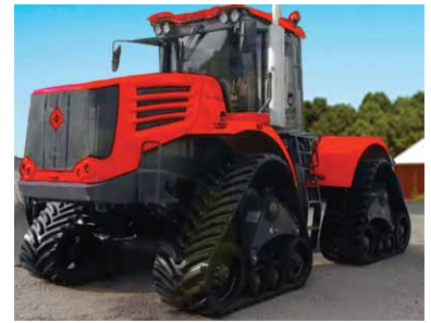
Track Version Available

GET MORE DONE WITH LESS. Less hassle, less fuel, less maintenance – and more power. Simple and reliable Tier 3 engine does not require DEF liquid. Regular maintenance is less of a hassle as well, because it's performed standing at ground level, and less often than with any competitive tractor. Engine Oil only needs to be changed every 600 hours. And you use one oil for all hydraulic operations.