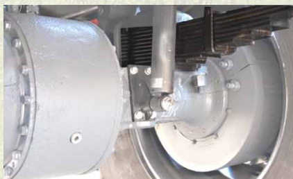
Leaf Spring Suspension

To reduce long term damage from shocks and vibration, the engine, transmission, cab and fuel tank are installed on frame using rubber/metallic pads which extends life expectancy of the components.